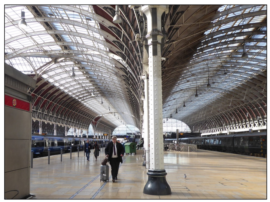
Paddington station, the spacious post broad gauge platforms below the massive train shed roof. In my youth we could drive down onto the platform to pick up passengers.

trains. It still has the largest brick-built span in the world.