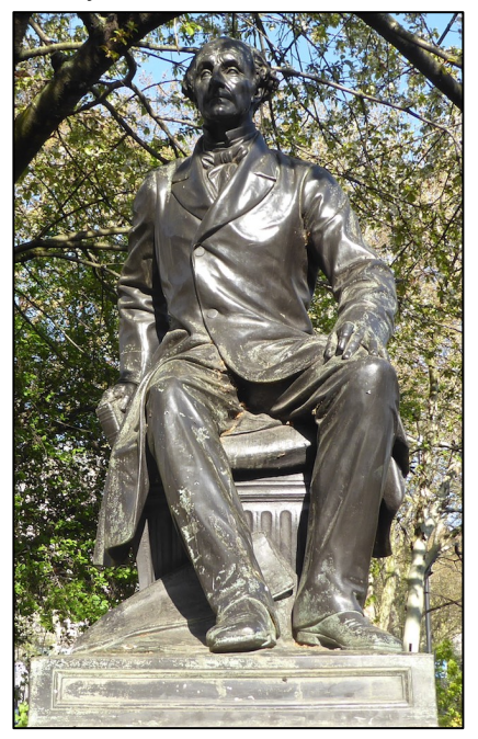
Brunel in Temple Gardens in a thoughtful mode without cigar!

pulled by two horses. Isambard worked night and day surveying, snatching sleep whenever he could. The Britzska was nicknamed the Flying Hearse . The survey started in March 1833 and was complete on time in March 1834.