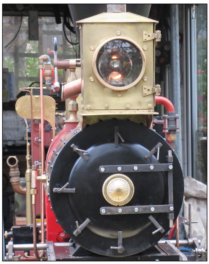
First view outside on the 8th April 2019

worked relentlessly through the winter to improve and beautify our wonderful track and grounds at Tyttenhanger, I have been encouraged by the number of members who have remarked at how nice and railway like the track at Smallford now looks with its new track bed of pink granite. refurbished turntable, painted up bench, and cream fencing to boot. There are also plans afoot to smarten up the covered steaming bay, the object being to make it more user friendly by shielding us from the wind and